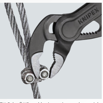
Amazing flexibility: The self-locking effect of the KNIPEX Cobra ^{\circ} XS enables it to grip round materials up to Ø 28 mm extremely reliably — and, due to its very slim head, it can also hold small components in place.